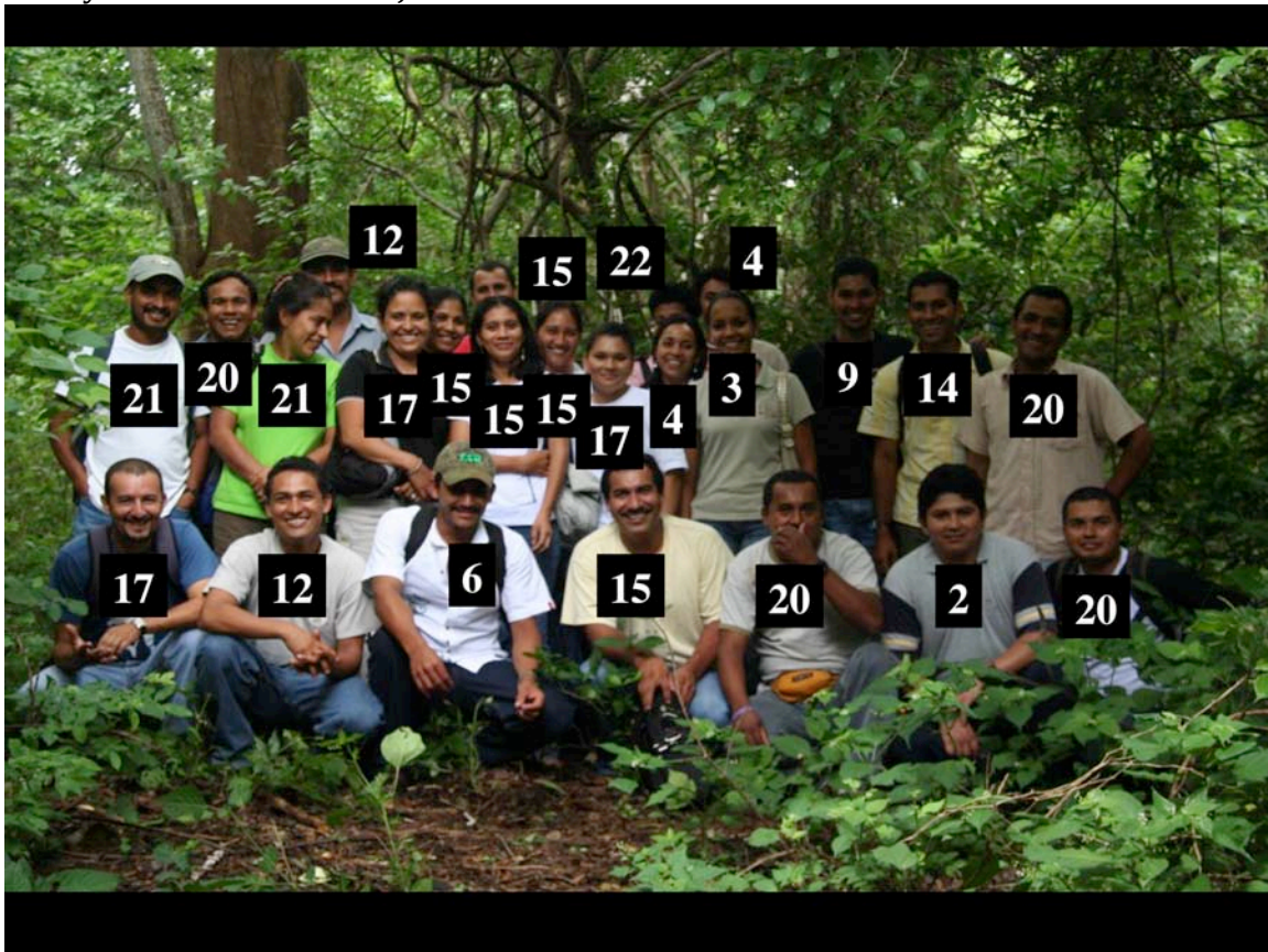
Figure 3. The majority of the ACG Costa Rican resident parataxonomist team (a.k.a “gusaneros”) in 2008 (Estación Biológica Santa Rosa). Each is labeled with the number of years they have worked conducting the ACG caterpillar inventory and adult moth and butterfly inventory (BioLep).

rain forest (various greens), with the expected intergrades. (2010). Image credit, Waldy Medina and Daniel Janzen.