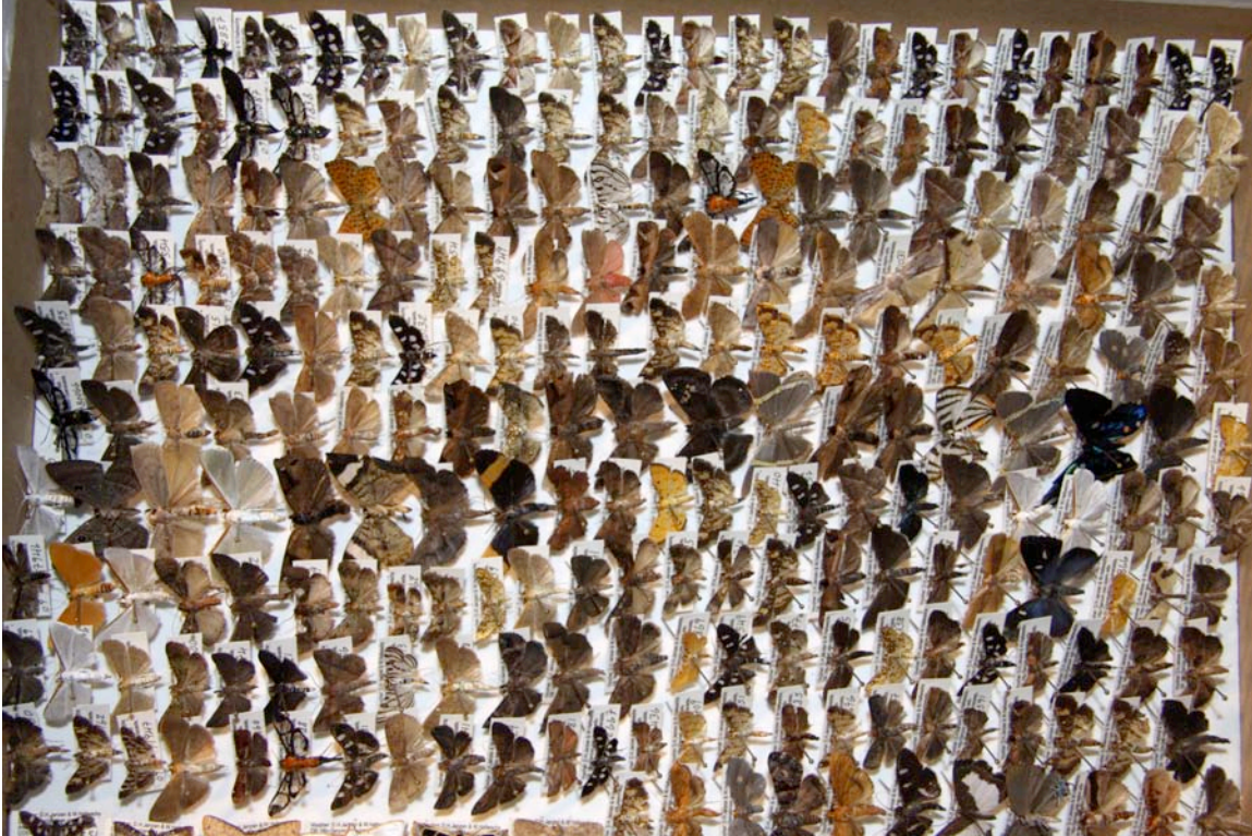
Figure 4. A box (same size as the white box in Figure 8) of reared, databased, spread and oven-dried ACG small moths and butterflies, as delivered by a parataxonomist (Johan Vargas). Each specimen has its unique voucher code on its pin, and each will lose one leg to the barcoding process as it passes through the central clearing center at the University of Pennsylvania on its way to permanent residence in the Smithsonian Institution, INBio, or other museum. (August 2010).