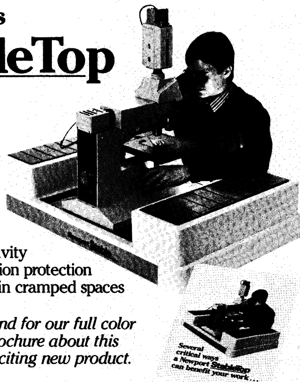
Several critical ways a Newport StableTop can benefit your work...

Send for our full color brochure about this exciting new product.