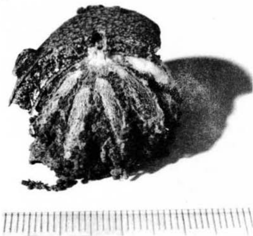
Fig. 2. Mass of cocoons of Ectomyelois muriscis broken out of a mature fruit of Hymenaea courbaril . The moth exit hole through the fruit wall is visible as a hole cut through the fruit wall at the point of convergence of the cocoons (Santa Rosa National Park, Costa Rica).