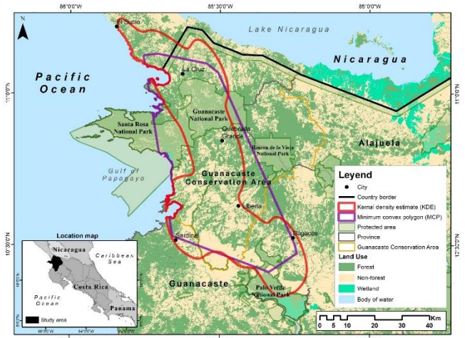
Figure 1. Home range estimates of a male coyote captured in the Guanacaste Conservation Area, northwest Costa Rica, in 2019 using two different techniques: minimum convex polygon and kernel density estimate.

An additional explanation for coyote nocturnal activity might be the overlap of their main prey which are mostly nocturnal, such as rabbits ( Sylvilagus floridanus ), white-tailed deer ( Odocoileus virginianus ), and rodents (Roll et