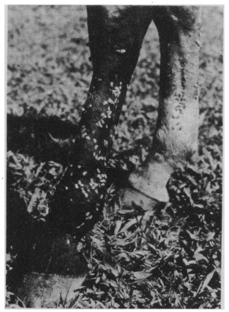
Fig. 5 (left). Spines, 7 to 11 centimeters long, on the underside of the petiole of the leaf of sapling Acrocomia vinifera (19). Fig. 6 (right). Desmodium (Leguminosae) beggar's-ticks stuck to the forelegs of a free-ranging horse on the edge of the Costa Rican rain forest (38).