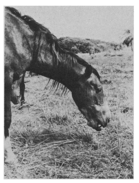
Fig. 4. Range horse breaking a ripe fruit of Crescentia alata between its incisors (19).

The postulated constriction of the range of C. alata after the extinction of the Pleistocene horse may affect other animals in the habitat. For example, nectarivorous bats would be affected by a reduction in jicaro density. The flowers of C. alata are nocturnal, abundant, and heavily visited by four species of nectarivorous bats in Guanacaste deciduous forests (24), and are the only common nectar source available to bats in the park forests during several months of the rainy season. The decline of the jicaro