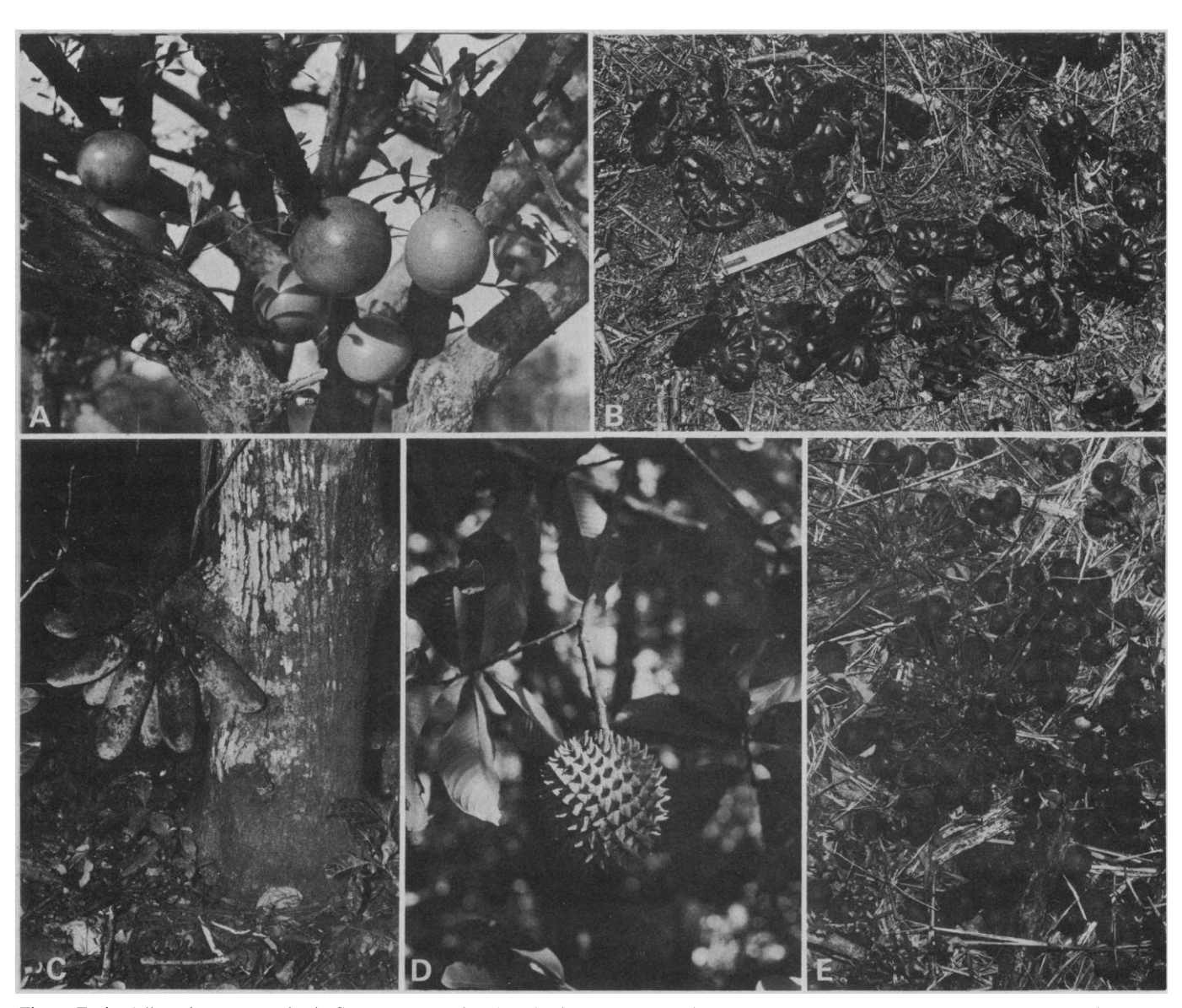
Fig. 1. Fruits (all to the same scale) in Santa Rosa National Park, Guanacaste Province, Costa Rica, that were probably eaten by Pleistocene megafauna: (A) Crescentia alata (Bignoniaceae), (B) Enterolobium cyclocarpum (Leguminosae), (C) Sapranthus palanga (Annonaceae), (D) Annona purpurea (Annonaceae), and (E) Acrocomia vinifera (Palmae) (19). The white portion of the rule in (B) is 15 centimeters long.

The palm population occurs in riparian vegetation, dry hillsides, and wooded patches in grassland and is largely main-