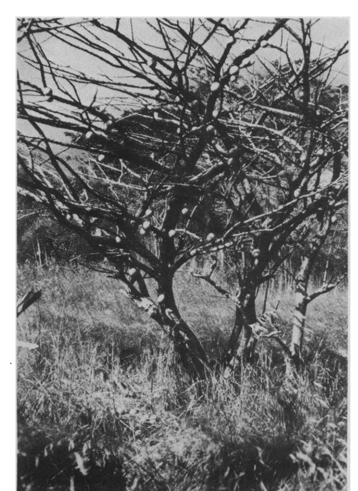
24 SCIENCE, VOL. 215

When range horses are free to forage below the trees, they quickly consume the crop of jicaro fruits. The hard fruits are broken between the incisors (Fig. 4), an act that requires a pressure of about 200 kilograms (22). The gooey pulp is scooped out with the tongue and incisors and swallowed with little chewing. For more than ten consecutive days, three captive and well-fed range horses ate the fruit pulp of 10 to 15 fruits in each of two meals a day, one in the morning and one in the evening (22). A herd of 17 range horses broke and consumed 666 jicaro fruits in one 24-hour period (22). The percentage of seeds that survive passage